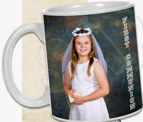
Ceramic Mug 11 oz. $19