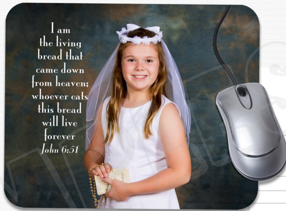
Mouse Pad $24

Photo Postcard Announcements (set of 24) including envelopes $69↓