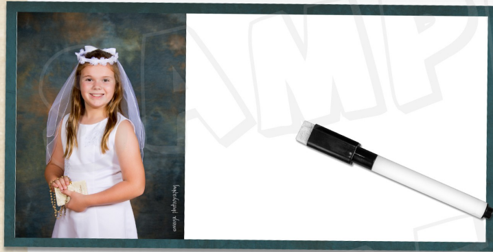
5" X 10" Dry Erase Board $31