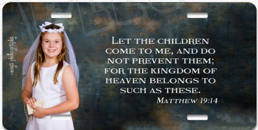
License Plate $29