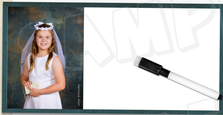
5" X 10" Dry Erase Board $31