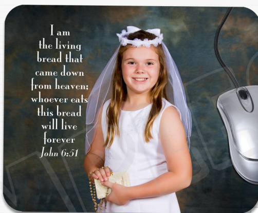
Mouse Pad $24

Photo Postcard Announcements (set of 24) including envelopes $69↓