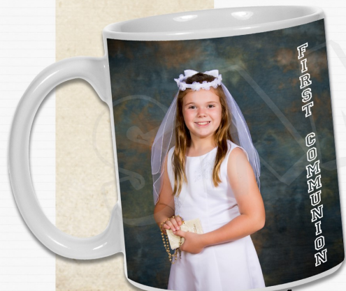
Ceramic Mug 11 oz. $19