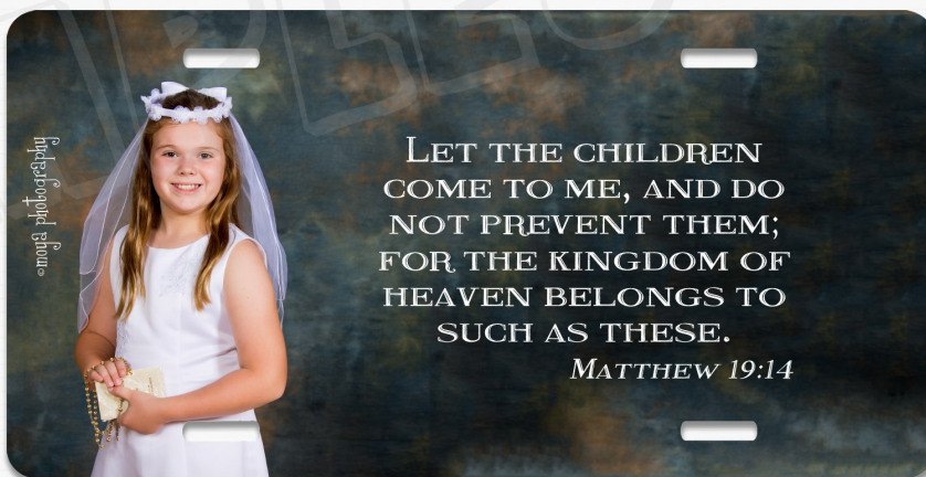
License Plate $29